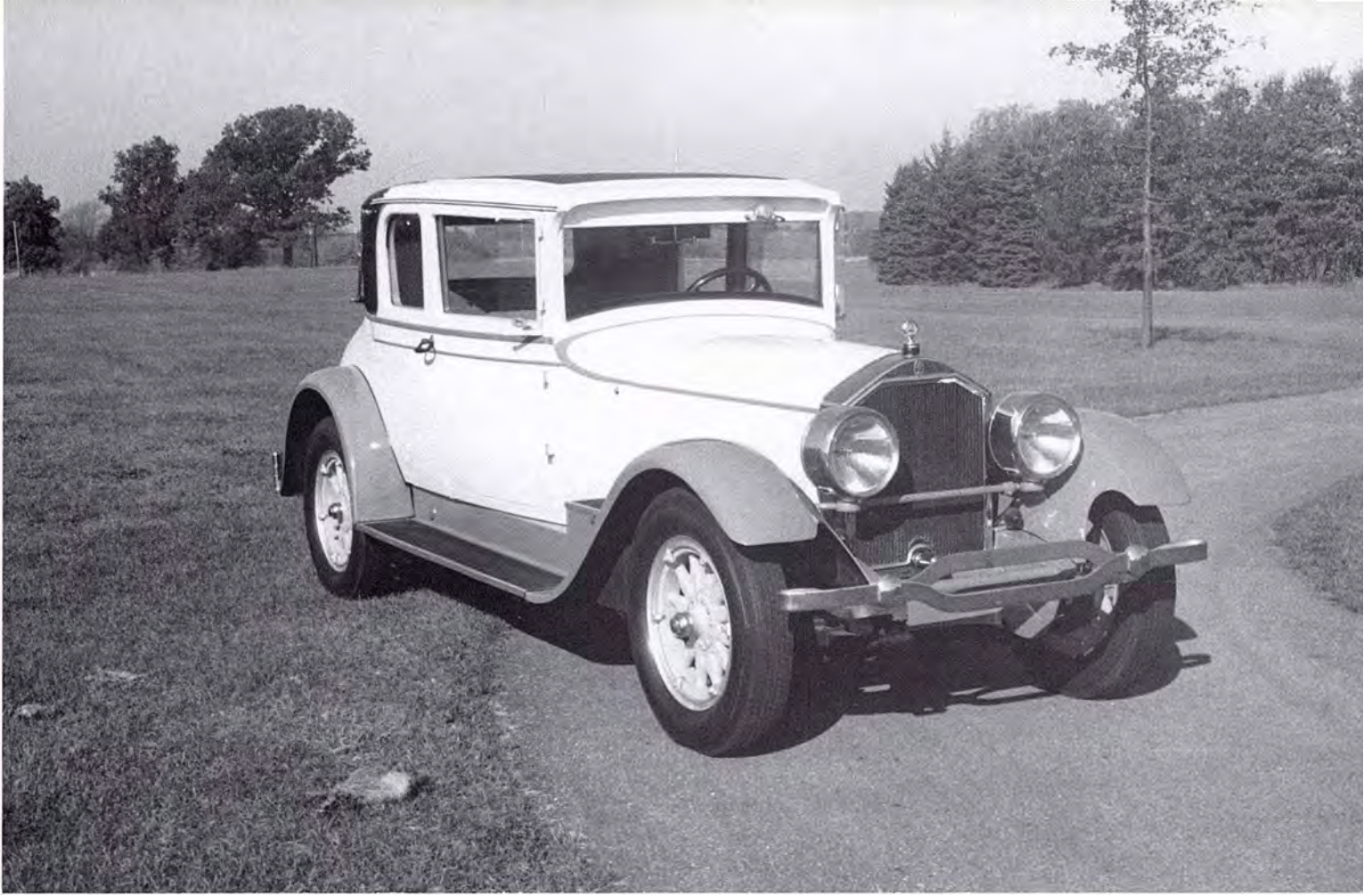
1927 Stearns-Knight Series F-6-85 Four-Passenger Coupe