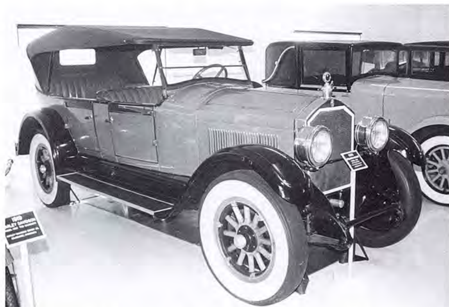
1926 Stearns-Knight Series S-95 Seven-Passenger Touring Owner: Minden Automotive Museum, Minden, Nevada